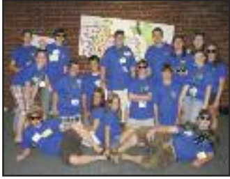
Form a Company