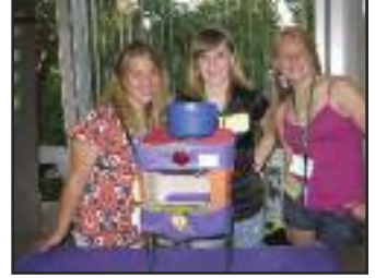
Create a Product