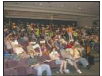
Hear Business Speakers