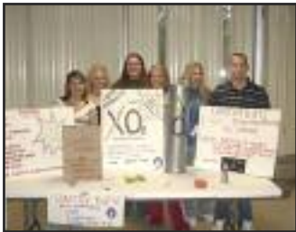
Design Marketing Materials