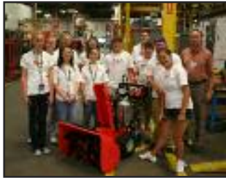
Take Company Tours