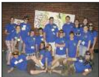
Form a Company