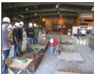
Take Company Tours