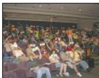
Hear Business Speakers