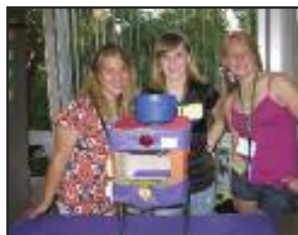
Create a Product