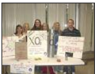
Design Marketing Materials